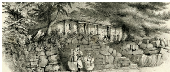
📍 Moss Cottage, George Rowe.

Visitors crossed a rustic bridge and took tea at a table made from a huge slab of walnut tree which had once grown at Chepstow Castle. 'The little rooms, seats, chandeliers of this cottage are all daintily covered with moss, and the cottage is hidden from the road by a thicket of laurels; here parties may picnic at their leisure' , wrote William Makepeace Thackeray in 1842. The original Moss Cottage was demolished in the 1950s.