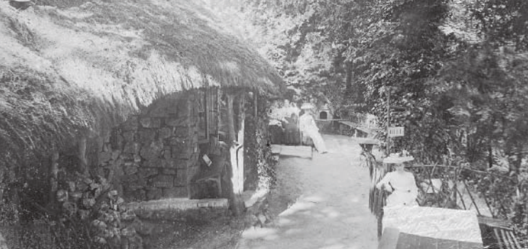
📍 Moss Cottage.