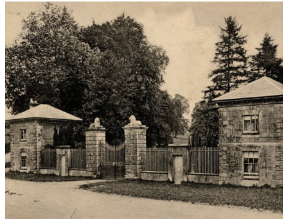
◀ Lion's Lodge entrance to Piercefield Estate.

Turn right and continue down the path and steps.