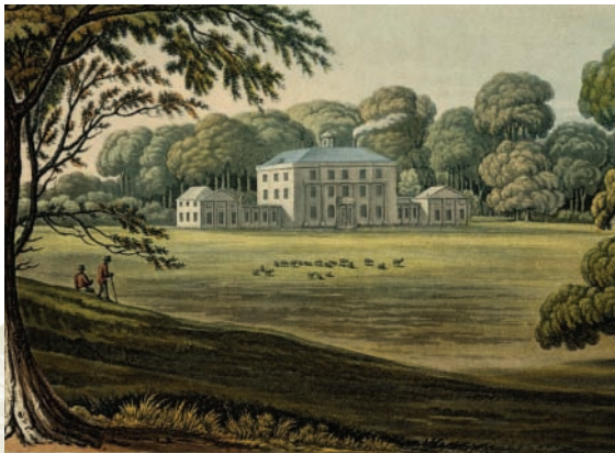
📍 Piercefield House, Stockdale.

'The view from the house is soft, rich, and beautifully picturesque: .... Not one rock enters into the composition: the whole view consists of an elegant arrangement of lawn, wood, and water.' (The Times, 1798)